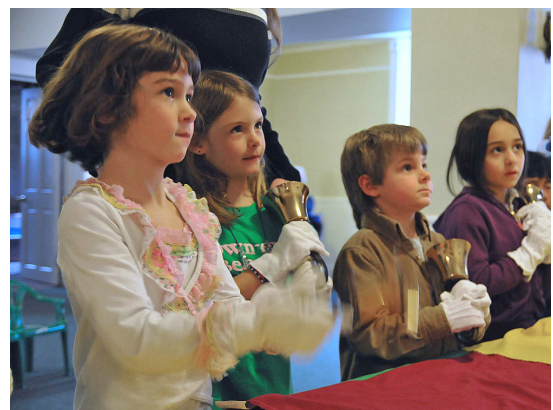
Handbell choir practice in Religious Education.