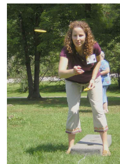
Polish horseshoes at Church picnic, 2006

The church picnic will be held immediately after the 10:30 service at Plum Creek Park on June 8. There will be only one service that day (and thereafter for the summer). Remember to bring your food and coolers with you to the service. Hey Boo-Boo! Another Pic-a-nic basket !