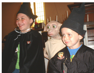
Wee wizards, Hogwarts 2003

We will explore the tradition of active non-violence as a way of making peace and creating social justice. Our main text will be Martin Luther King Jr.'s "Pilgrimage to Non-Violence" from his book Stride Toward Freedom: The Montgomery Story . We will also draw from the writings and examples of Thoreau and Gandhi.