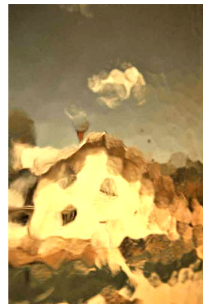
The Annex through a sanctuary window.

Sessions start soon so don't delay - reserve your spot for a very special evening 6 times during the summer.