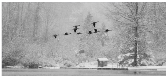
Meanwhile the wild geese, high in the clean blue air, are heading home again - Mary Oliver