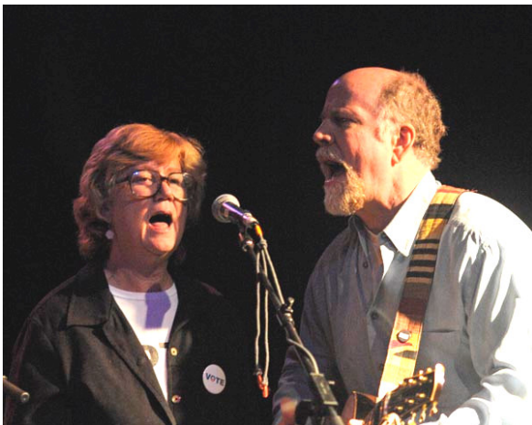
Holly Near and John McCutcheon at "Sing Out the Vote" Concert

If there is overwhelming response, we will consider adding another session!