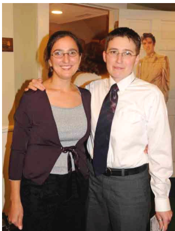
Celebs at the church auction

Some have already paid their entire 2008 pledge - THANKS! Others have not paid anything on their pledge. Does this mean it will all come in during December? Or that your situation has changed? We can guess, but our