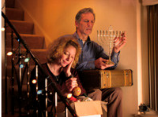
Scene from Both Sides of the Family

The performance is free and open to the public. Bring your friends!