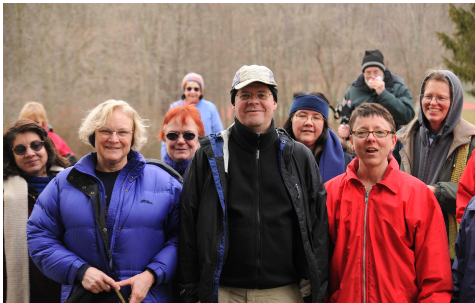
Happy hikers returning to the lodge at Winter Institute.