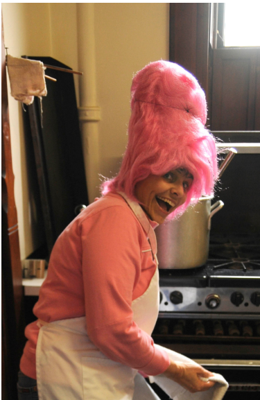
Kitchen witch at Hogwarts caught transfiguring hot dogs— note hair-net.

Respectfully submitted by the Social Justice Committee, UU Church of Kent