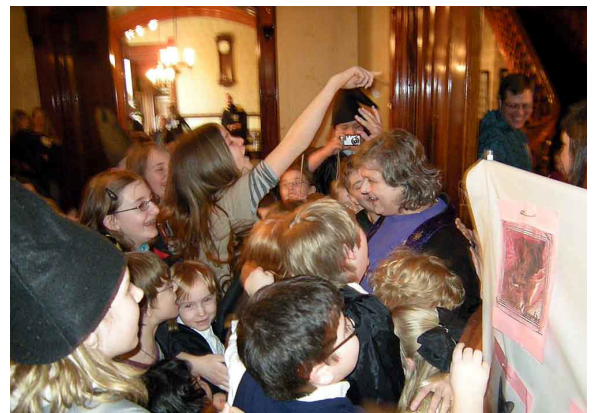
Professor Dazzleswift surrounded by adoring kids at Hogwarts