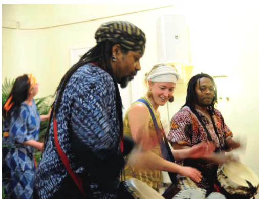
Kent African Drum Ensemble at church Healing Concert