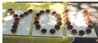
A message in the language of cupcakes from the Bowens at the church picnic