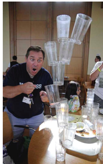
Fun with kitchenware at Summer Institute