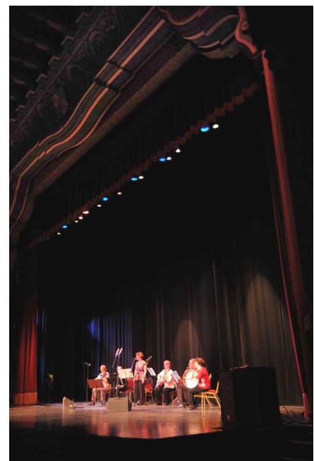
Celtic Clan hits the big time at the Canton Palace Theater.