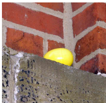
An egg hides from children at the annual Easter egg hunt at church.