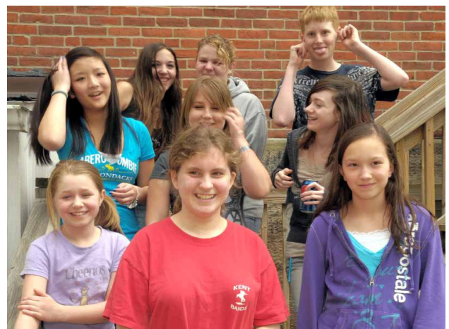
"The Family Project" youth gather for a photo. Their interviews and photographs will be compiled into a booklet.

When we go to one service, there is no out to lunch bunch.