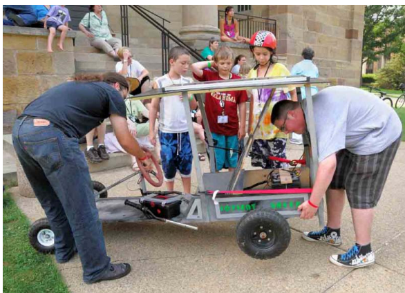
The Green Car at Summer Institute. They named it Soylent Green, of course.