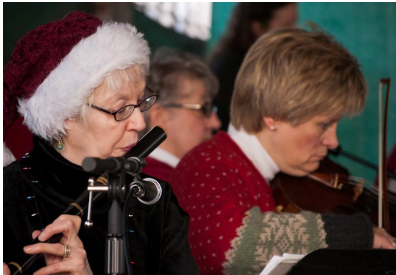
The Celtic Clan at Kent's Winter Farm Market

A complete and up-to-date church calendar can be viewed at http://www.localendar.com/public/uukent or through a link on our website at www.uukent.org .