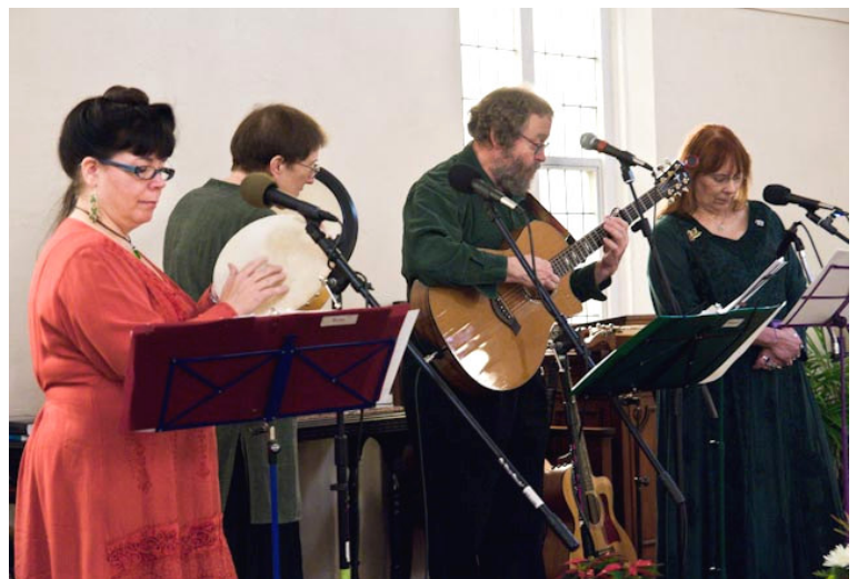
The Bittersweet Christmas Band from Chicago led a service the first week of December.

Friday January 6th will be our next Game Nite. We begin around 7:00 and continue until we have gamed ourselves out. Popular board games will be available, but we encourage you to bring your own favorites as well. Light snacks will also be provided, but anything you wish to share will be appreciated! Come to Fessenden Hall on the 6th for some good family fun!