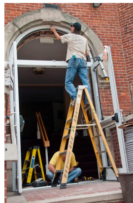
The new front doors and flooring were installed this week.