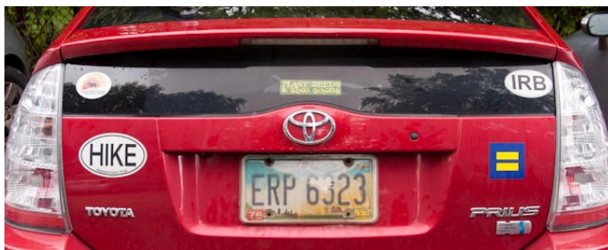
Seen in our parking lot