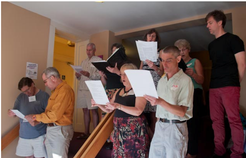
The church choir sings at the dedication of the new door.

This service will tie together spiritual and therapeutic concepts about acceptance and healing.