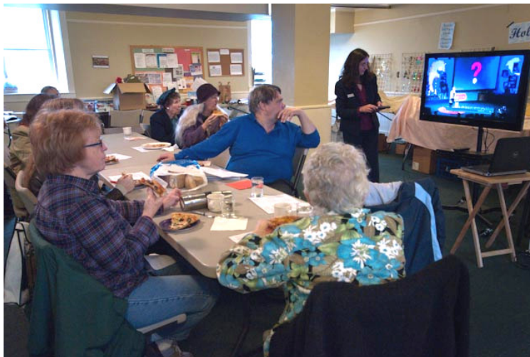
TED Talk and Pizza on a Sunday afternoon