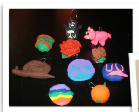
RE students worked hard last month to help honor our church's covenant..