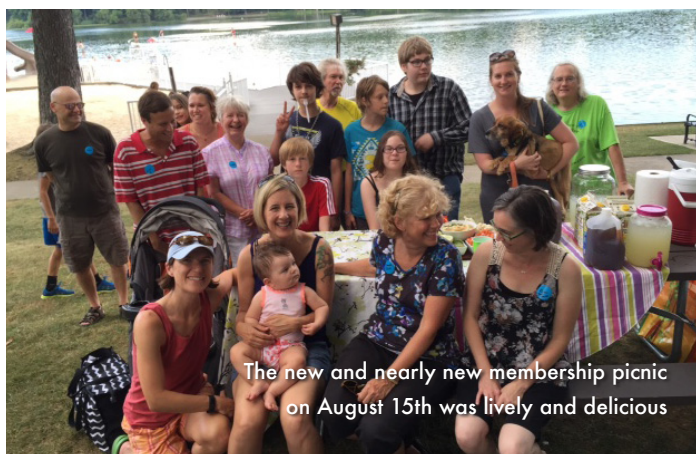
The new and nearly new membership picnic on August 15th was lively and delicious

Please stay for a short visit after First Service, or, come a little early before Second Service. We look forward to meeting you. Whether you are "brand new," "nearly new," "sort of new", or just want to meet UUs, plan to stop by the Meet & Greet table in the Founders' Lounge (same level as sanctuary) at 11 am (September 13th and every subsequent Second Sunday of each month). This is a family friendly event, so kids are welcome. Nursery care provided.