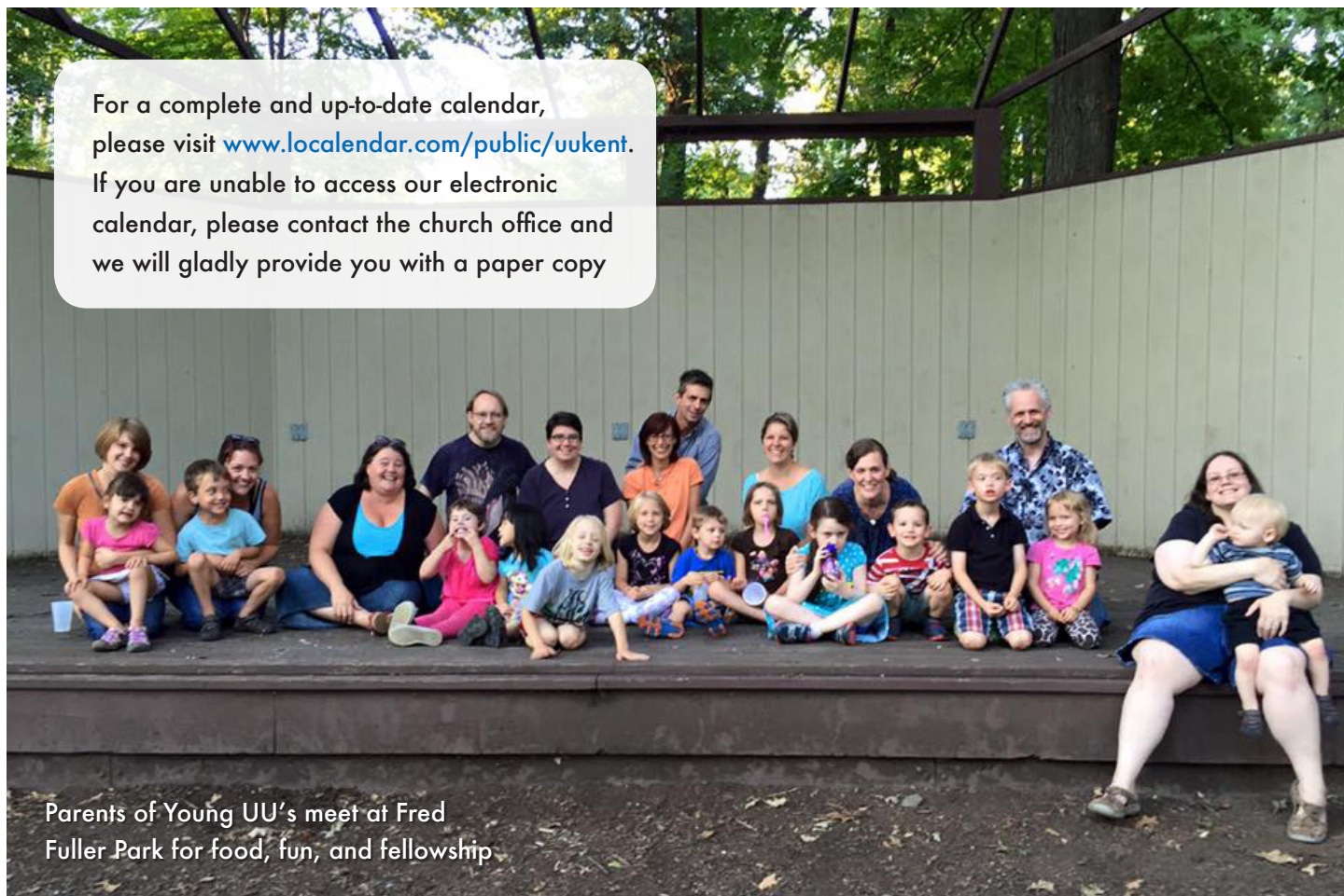
Parents of Young UU's meet at Fred Fuller Park for food, fun, and fellowship.

For a complete and up-to-date calendar, please visit www.localendar.com/public/uukent . If you are unable to access our electronic calendar, please contact the church office and we will gladly provide you with a paper copy